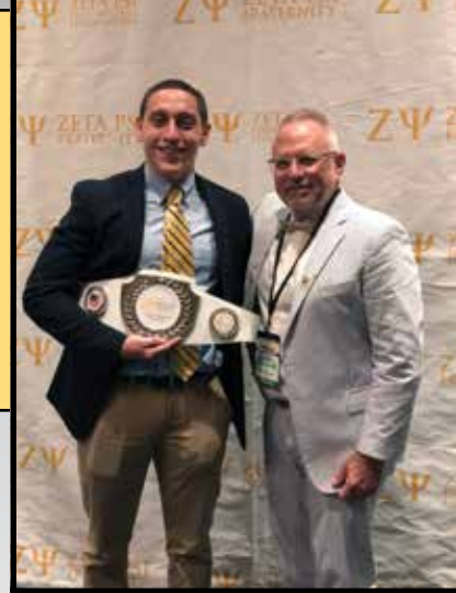
RPI - Top American Chapter

Congratulations to the following chapters for bringing home the 1847 Pledge Challenge belts in their respective categories: