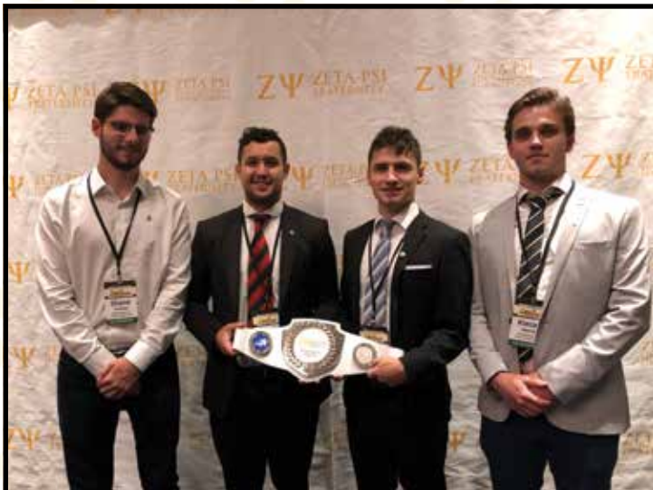
Trinity College, Dublin - Top European Chapter