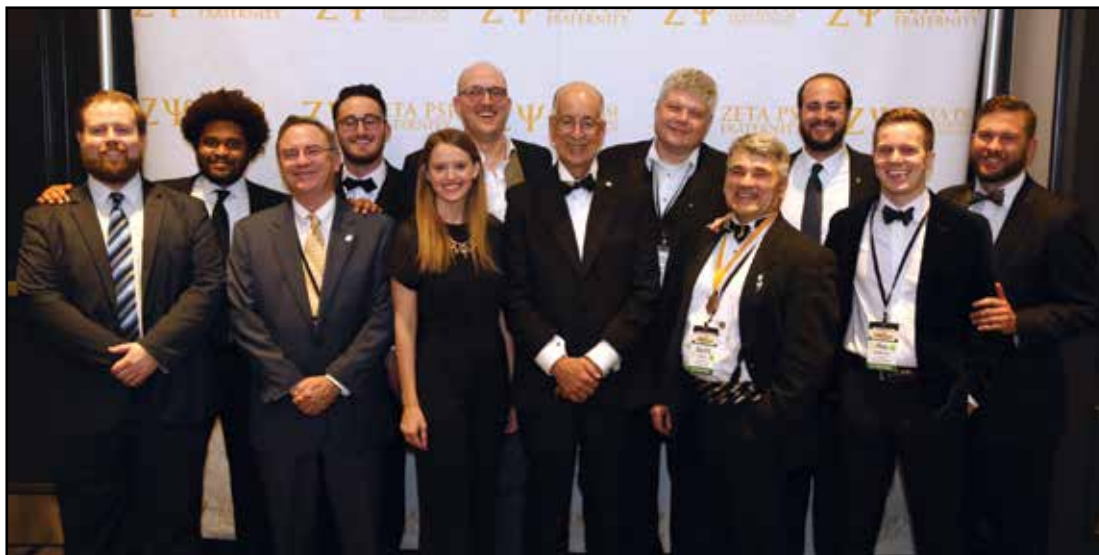
Zeta Psi International Headquarters Staff