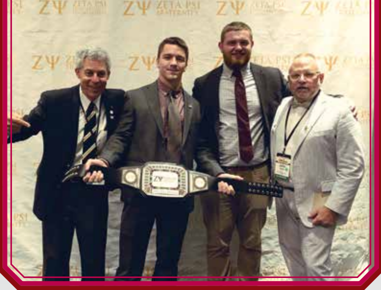
WPI - Overall 1847 Pledge Champions!