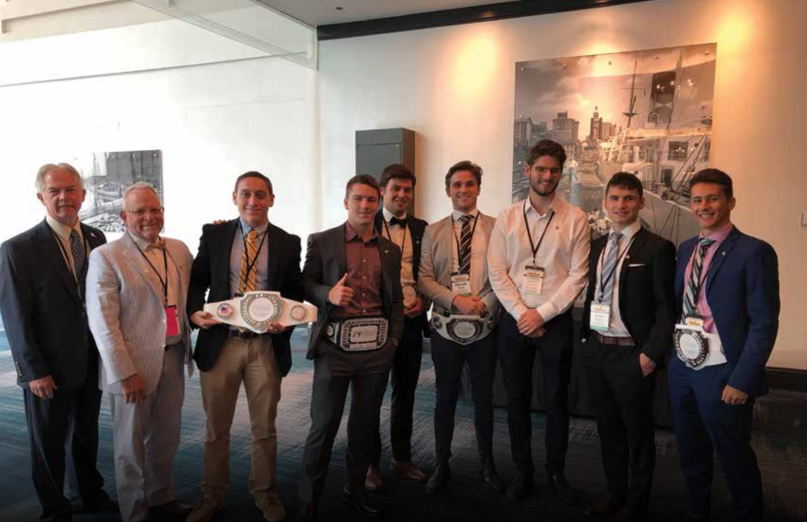
1847 Pledge Champions pose with their chapters' respective championship belts!