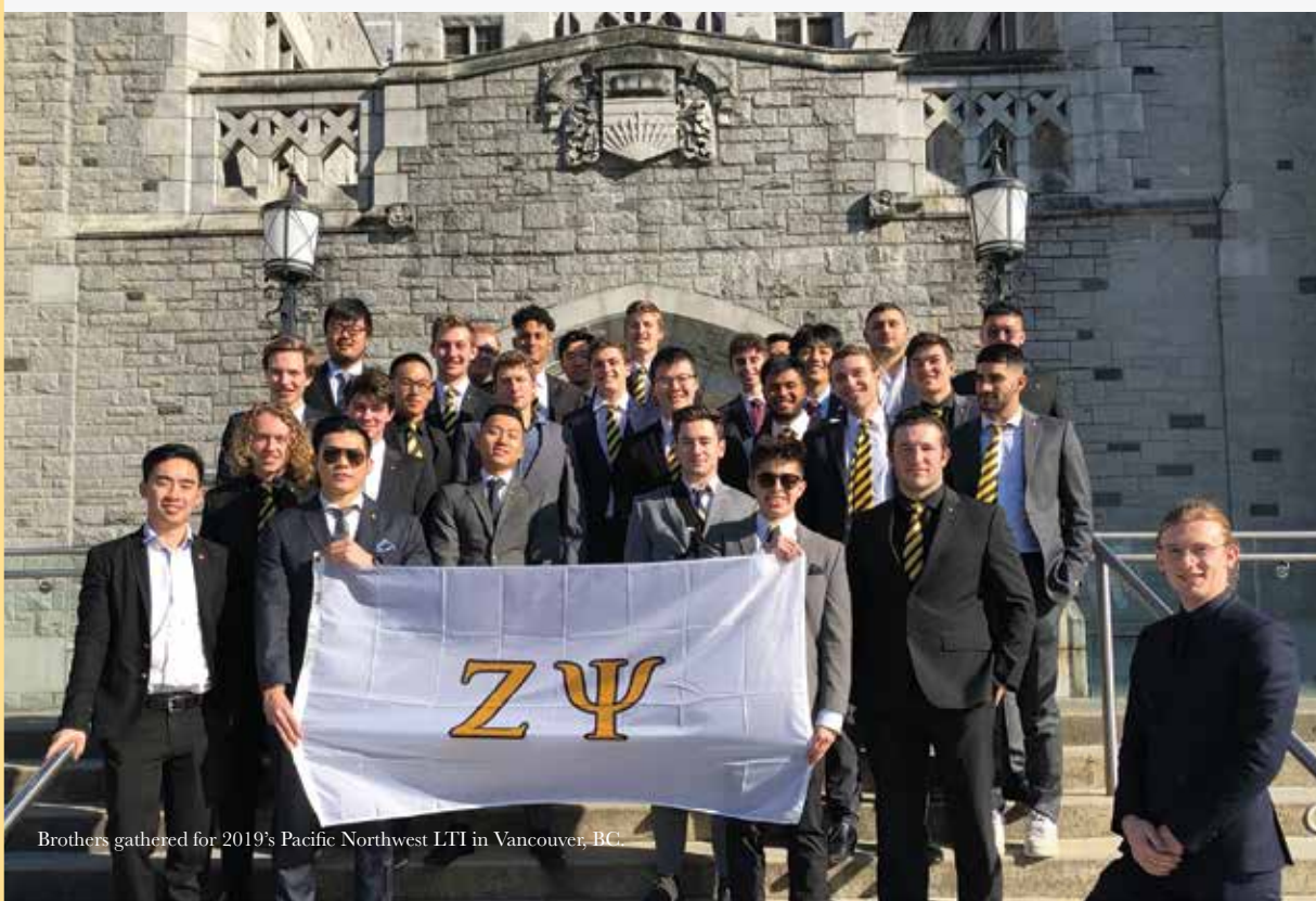
Brothers gathered for 2019's Pacific Northwest LTI in Vancouver, BC.