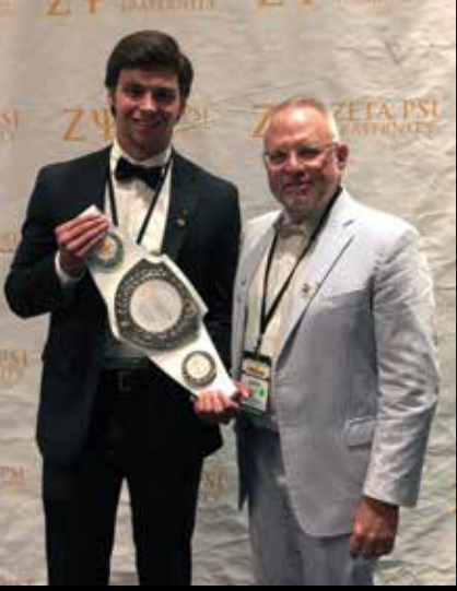
Queen's University - Top Young Chapter