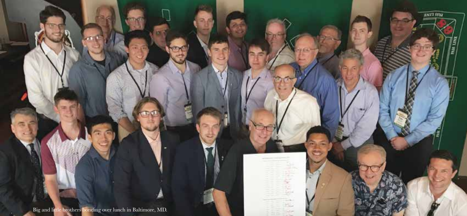
Big and little brothers bonding over lunch in Baltimore, MD.