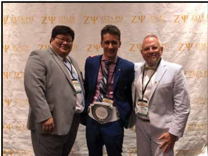
Waterloo/Wilfred Laurier - Top Canadian Chapter

The 1847 Pledge Challenge will return in 2020!