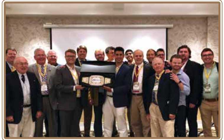
The Cornell Chapter accepting the championship belt for the 1847 Pledge.

which is the anniversary of the founding of the Theta Xi Chapter at the University of Toronto – an act which made Zeta Psi the first international fraternity. Regardless of nationality, this Zeta Psi first is a point of pride for every member of our brotherhood. It has continued to inspire Zeta Psi as we have expanded overseas to new chapters. During the 2018 weeklong campaign, 496 brothers showed their pride in Zeta Psi by participating and contributing $23,130.88 towards membership education for Zetes.