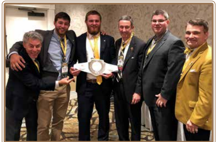
The Pi Tau Chapter accepting the "Top American Chapter" belt.