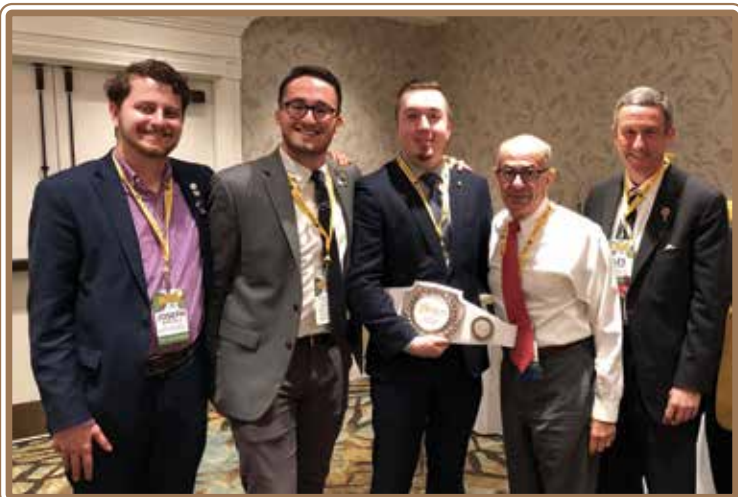
The Delta Chi Chapter recognized as the "Young Chapter" champion.

Thank you to all of our participants - they're recognized on pages 15-18.