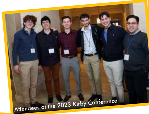
Attendees at the 2023 Kirby Conference