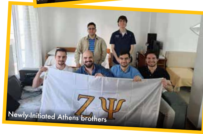
Newly-Initiated Athens brothers