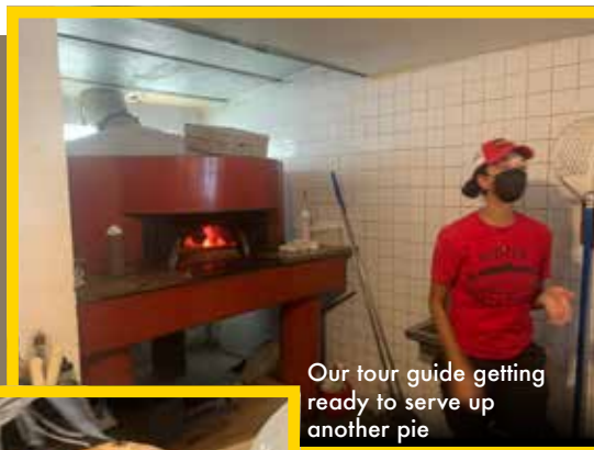
Our tour guide getting ready to serve up another pie