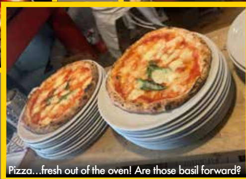
Pizza...fresh out of the oven! Are those basil forward?